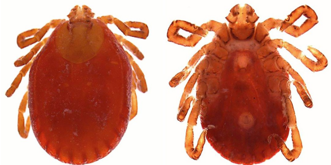
Adult Asian longhorned tick

Two species of Haemaphysalis ticks are native to the United States: H. leporispalustris (rabbit tick) and H. chordeilis (bird tick). These two species feed almost exclusively on their respective hosts. Asian longhorned ticks may be confused with these and other native species, but if they are identified on other hosts (cattle, deer, etc.), it is highly likely they are H. longicornis . Juveniles also may be confused with immature lone star ticks, which are found in the extreme southern and eastern parts of Pennsylvania.