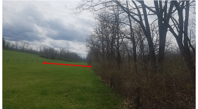
Maintaining at least 9 feet between tick habitat and pasture or lawn can reduce tick encounter risk.

Pasture and lawn control measures—such as maintaining low grass height, controlling weeds and other brushy areas, and removing woody debris from pasture and lawn edges—can reduce tick-bite risk. Maintaining a 9-foot distance between pasture or lawn and wooded edge habitat can reduce the risk of tick contact. Perimeter applications of biopesticides, such as Met52™ or pyrethroid-based or carbamate insecticides can be applied by an individual in some cases in areas where ticks may be encountered. With some products, a professional pest-control applicator is required. Be sure to follow all label instructions and safety recommendations. Permethrin-treated clothing and DEET, picaridin, or IR3535 can be used as personal repellents. Whole-animal insecticide treatments, such as Permethrin™ II and Ultra Boss™, can be used for some livestock. Fipronil-based products or similar can be used for small companion animals. Consult your veterinarian for recommendations specific to your situation and animals.