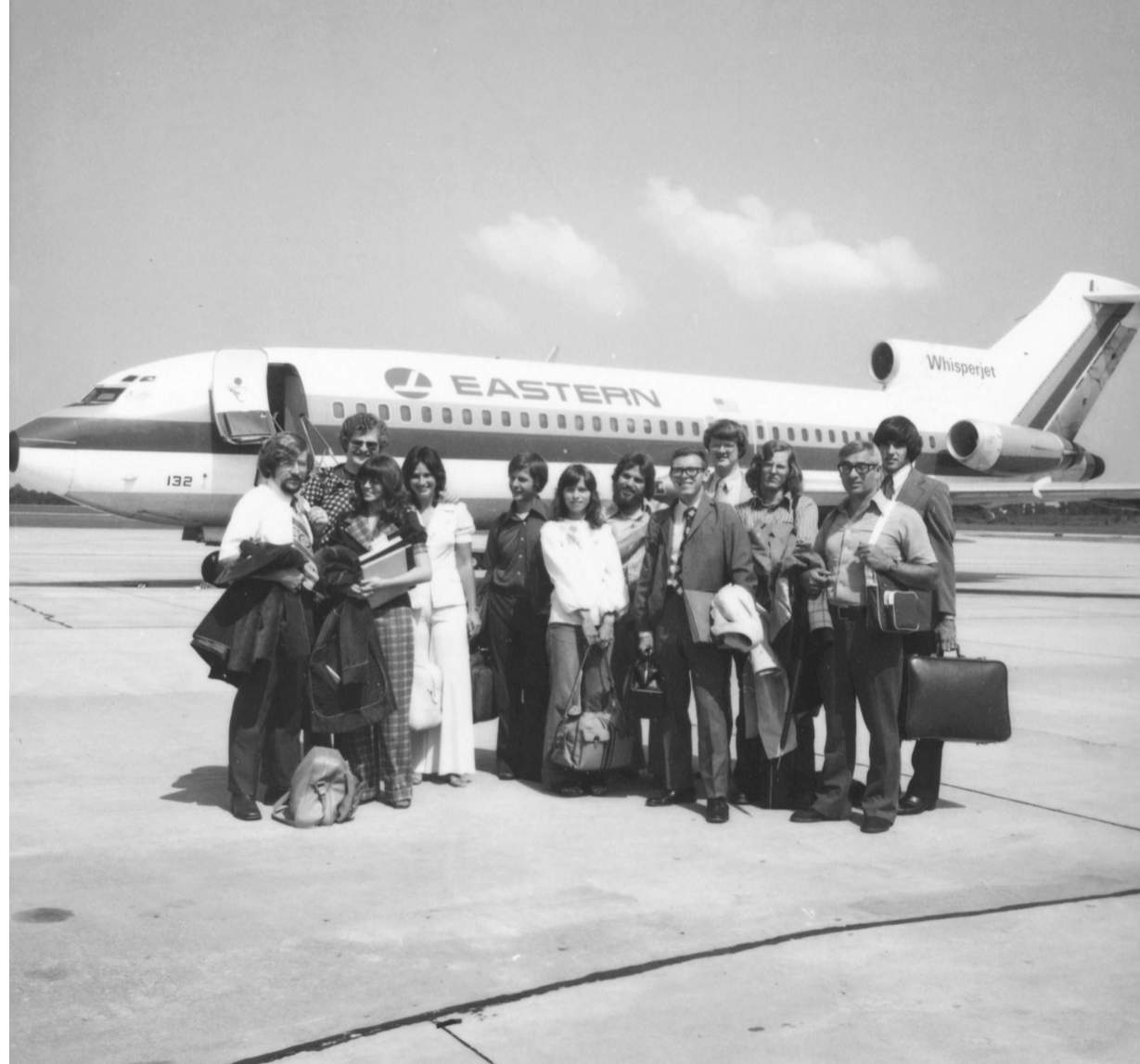
First group of students and faculty leaving for Italy on August 27, 1973