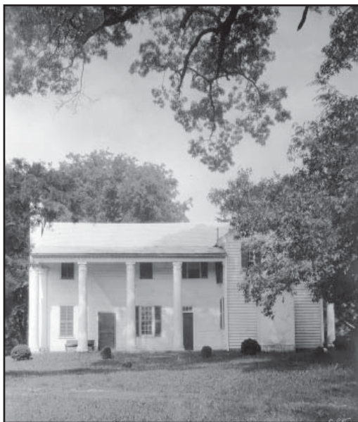
Fort Hill mansion