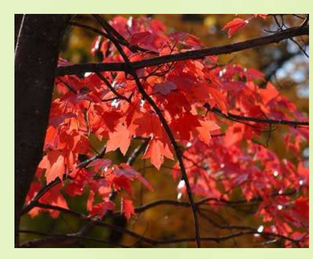
Red maple (Acer rubrum)