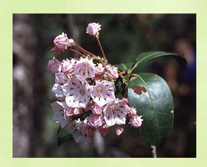
Mountain Laurel (Kalmia latifolia)