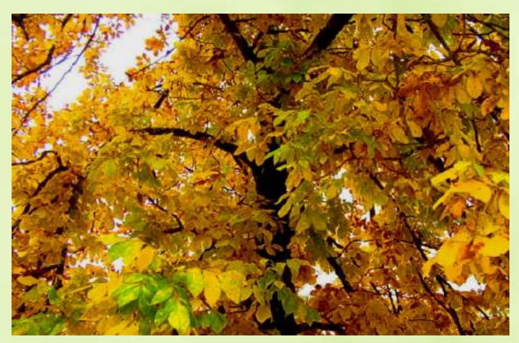
Mockernut Hickory (Carya tomentosa)