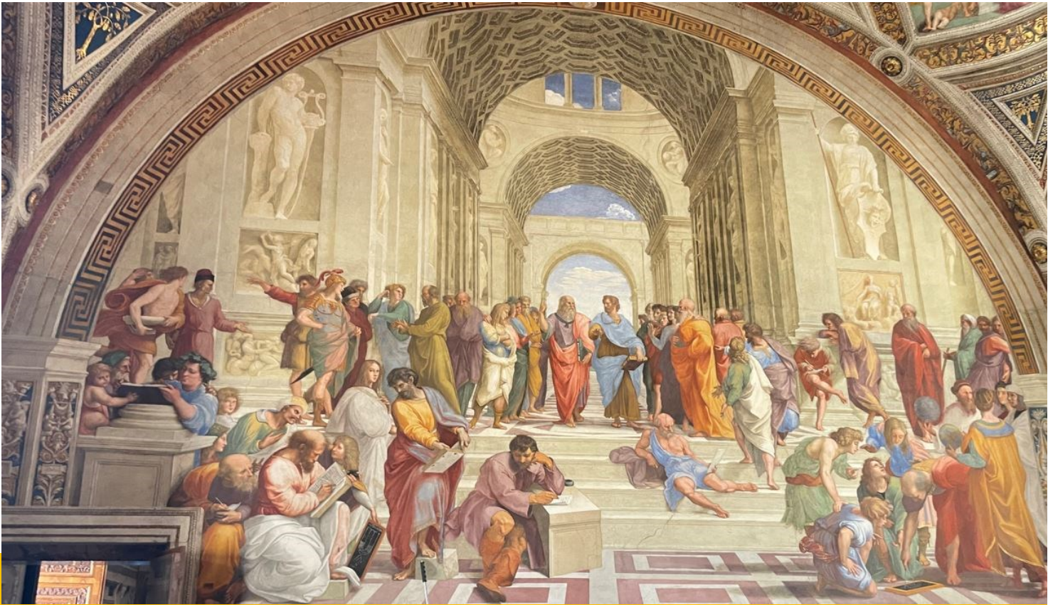
Photo taken at 2018 alumni event

Don't miss the 2022 History and Geography Alumni Event! September 16, 4-6 p.m. in Hardin Hall. Take the opportunity to: