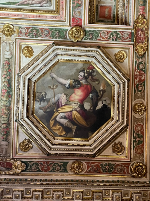
Clio, the Muse of History, at the Medici Villa in Rome. Clearly the most badass of the Muses.