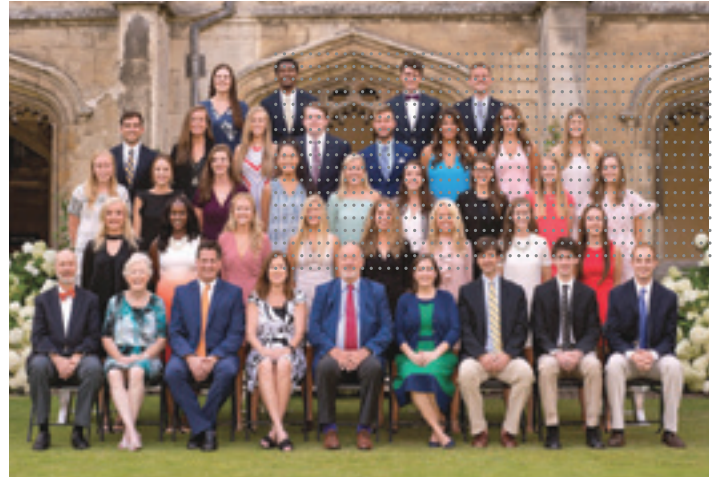
St. Peter's College, Oxford University Summer Study Abroad graduate (left) and undergraduate (right) students

Our accounting programs offer several opportunities for global engagement. Two of the most popular study abroad programs attended by accounting undergrad students include a five-and-a-half-week summer program in Oxford, England, and a five-and-a-half-week summer program in Rome, Italy. Students spend a week-and-a-half on Clemson's main campus and end with four weeks abroad. Students typically take two accounting classes (taught by Clemson faculty), which include guest lectures from international faculty and time for engaging with the people and culture of the local regions.