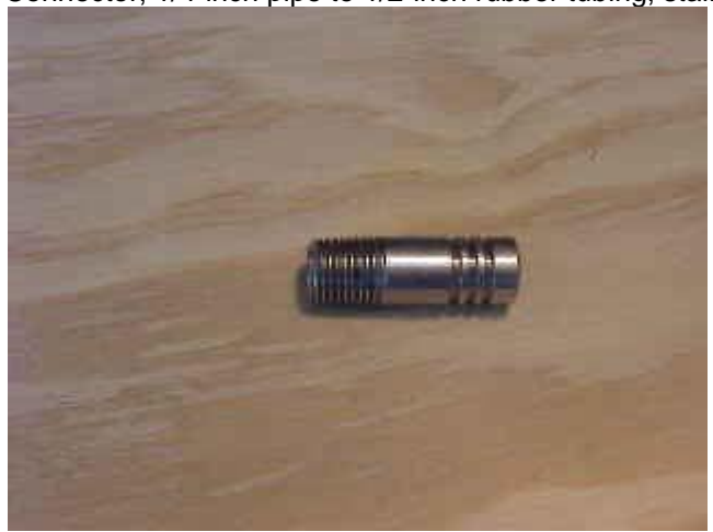
Connector, 1/4-inch pipe to 1/2-inch rubber tubing, stainless steel