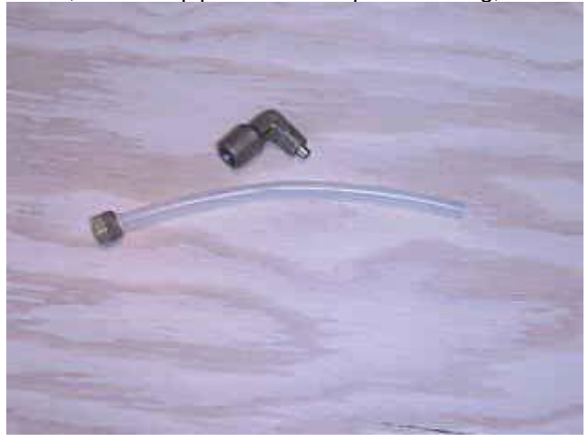
Connector, 1/4-inch pipe to 1/2-inch rubber tubing, stainless steel