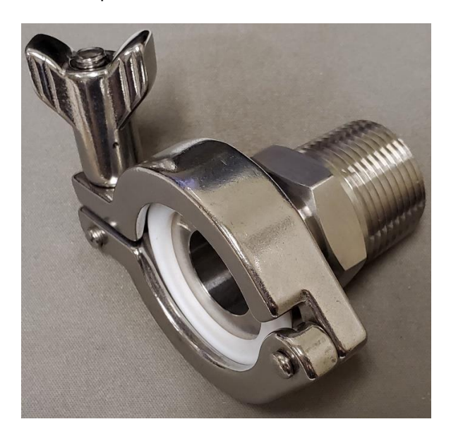
Male Adaptor, 1-inch NPT Thread to 1-1/2-inch Sanitary Tri-Clamp, with Teflon gasket