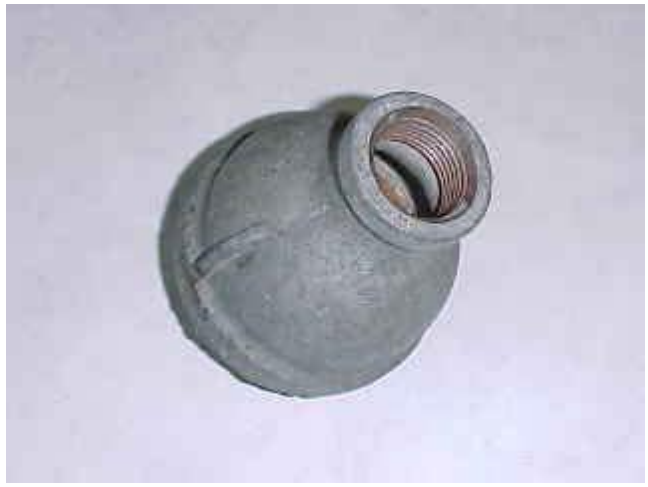
Coupling, reducing, 2 x 3/4-inch, threaded, galvanized.