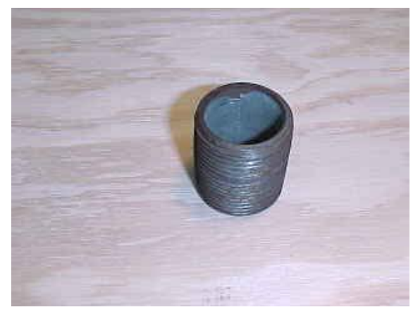
Nipple, close, threaded, 1-inch.