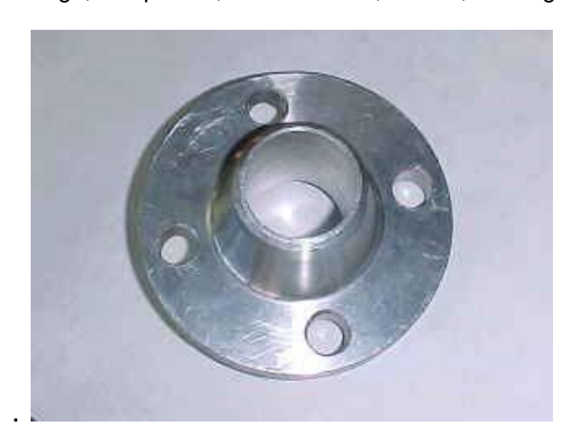
Flange, floor, 3/4 x 3-1/2-inch, threaded, galvanized.