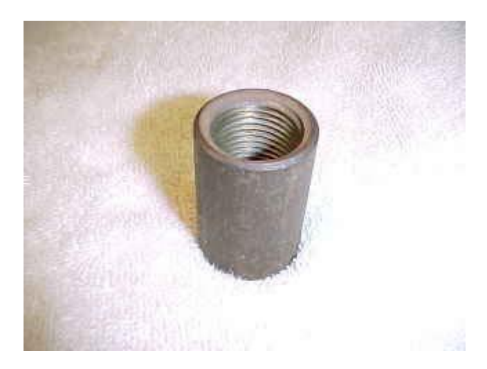
Bushing, 1 x 3/4-inch, threaded, black iron.

Coupling, straight, 1/2-inch, threaded, black iron.