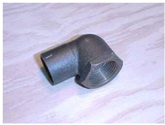
Elbow, 1-inch, screwed to sweat, brass.