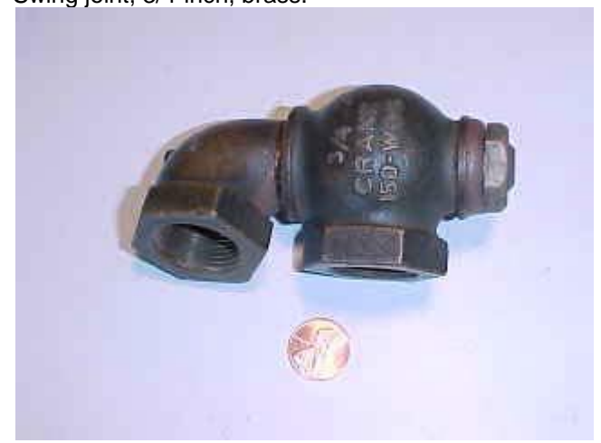
Swing joint, 3/4-inch, brass.