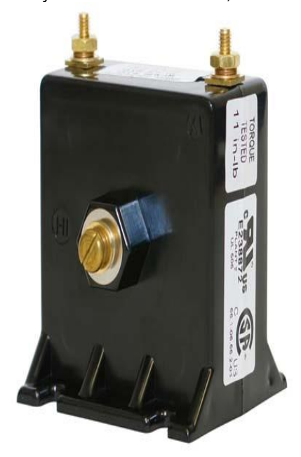
Wound Primary Current Transformer, 10:5 Current Ratio