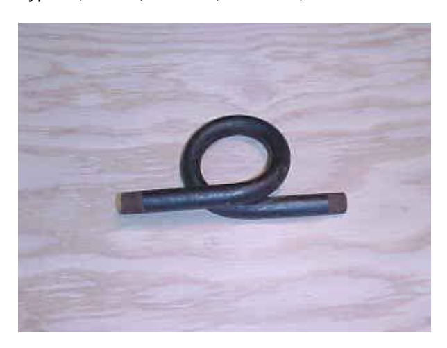
Indicator, sight-flow, 3/4-inch, brass, threaded

Syphon, steam, 1/4-inch, threaded, black iron