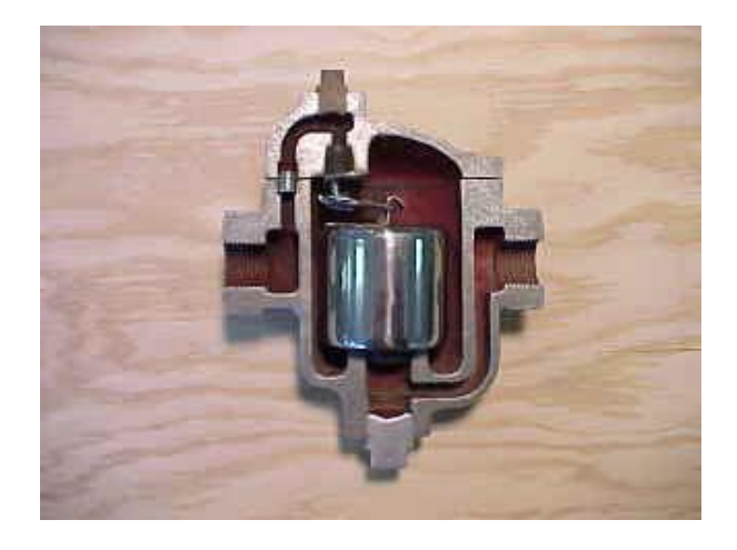
Steam trap, bellows type, 3/4-inch, brass