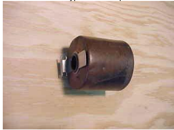
Bucket for bucket type steam trap