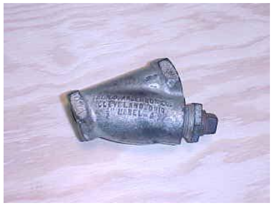
D3 Page 1