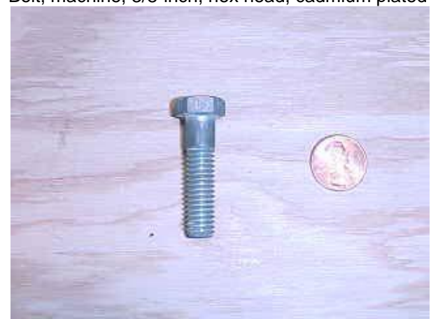
D3 Page 7