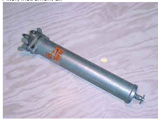
Filter, instrument air