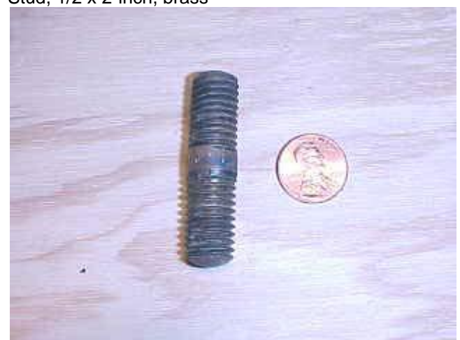
Stud, 1/2 x 2-inch, brass