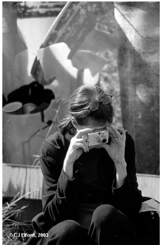
Student at Newry Mill