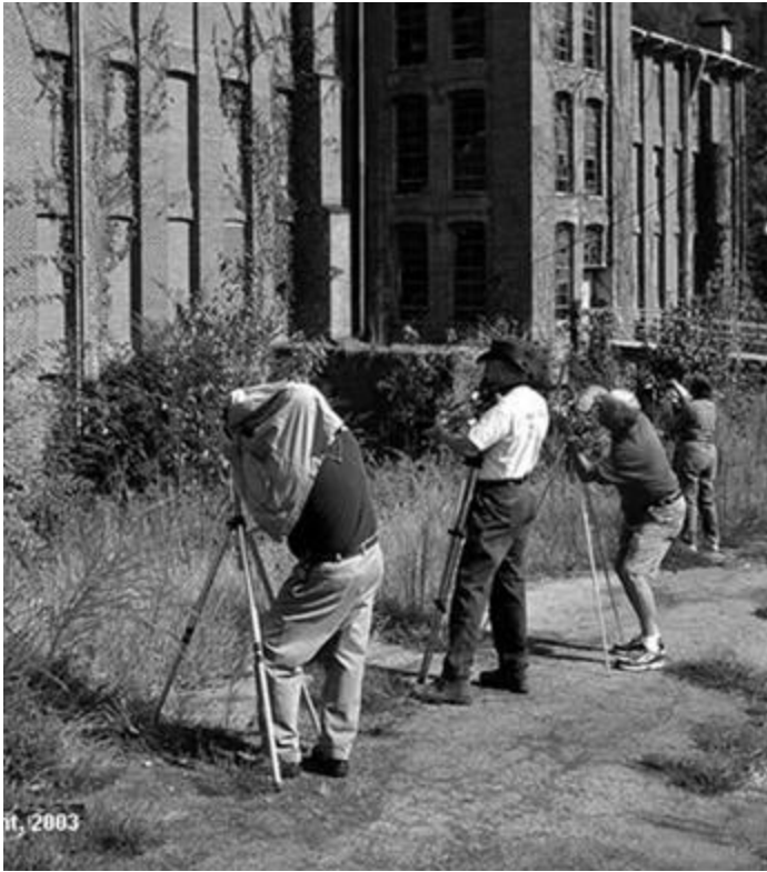
Digital Photography Class at Newry Mill