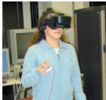
Clemson’s Virtual Reality Laboratory

The environment’s state-of-the-art technology tracks the trainee’s eye movement, allowing scan paths to be monitored. This information can be given as feedback to the trainee. Researchers are also