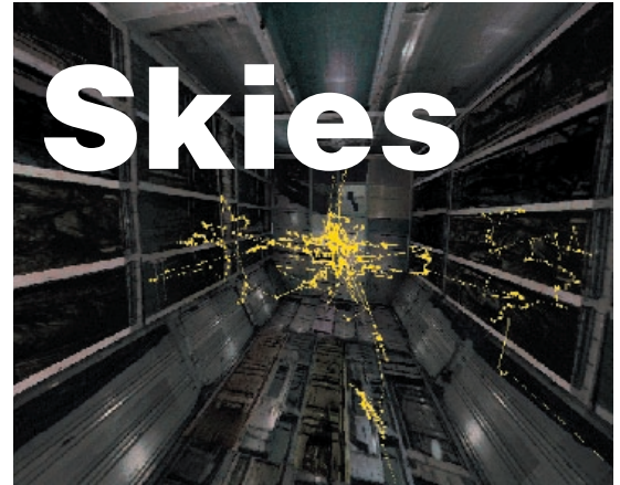
Eye movements of a trainee inspector in a VR environment

“At Clemson we have always conducted research, but now we are finding ways to apply this to actually impact aviation safety.”