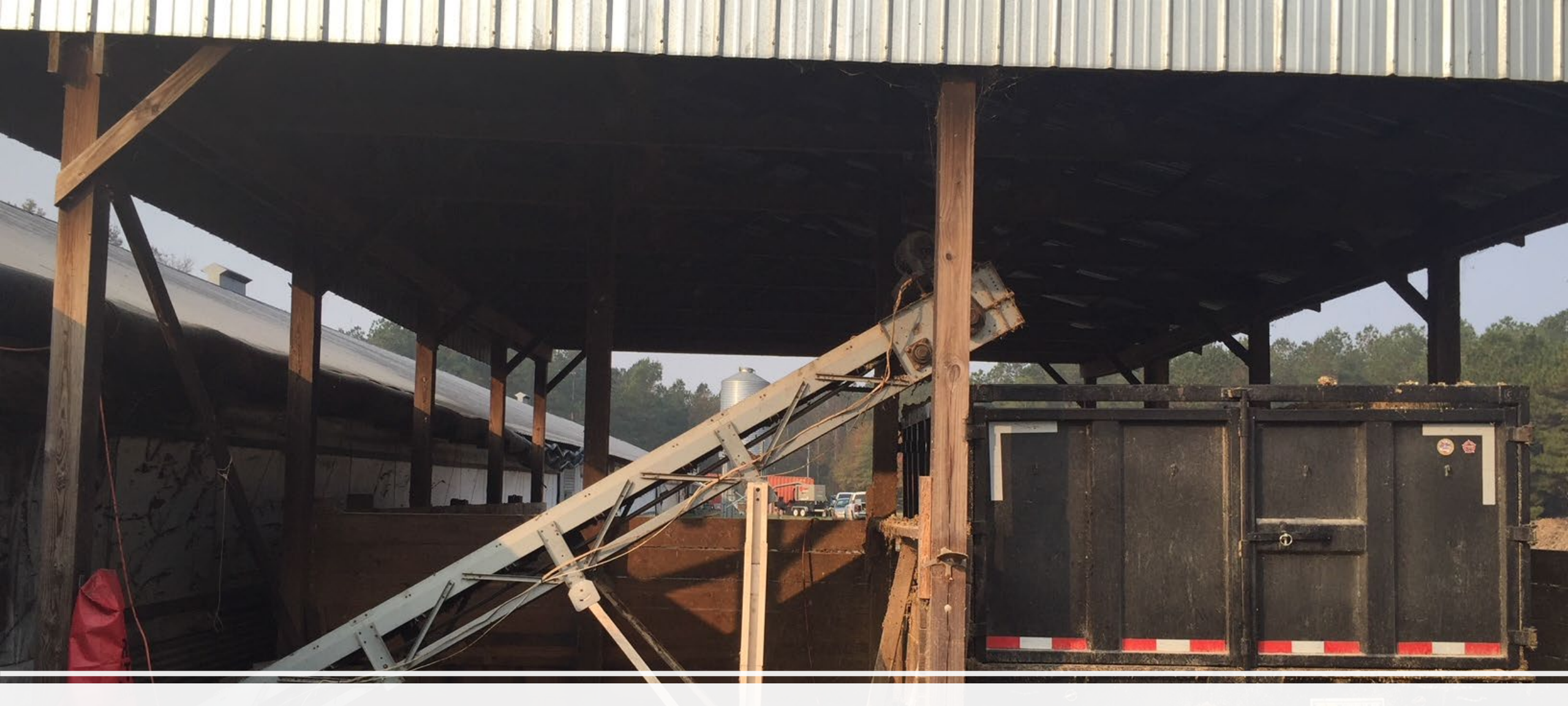
Raw material loaded into dump trailer