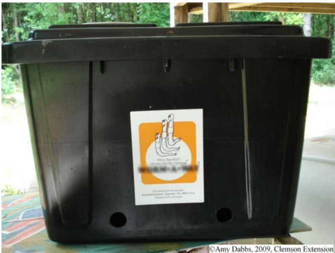
Commercial plastic worm bin.

Simple Plastic Bins: The most basic type of worm bin is an inexpensive plastic storage tub with drainage holes. These bins are easy to set up. The main problem with this type of bin is drainage and associated odors. Because temperatures are difficult to regulate in plastic bins, these bins are better suited to indoor locations.