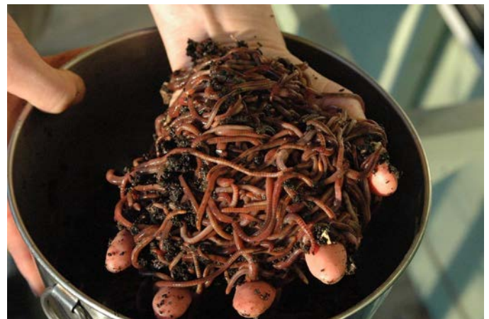
Red wiggler worms.

Red wigglers ( Eisenia fetida ) are small red worms that live in the uppermost layer of organic matter on top of the soil. Red worms can be found munching their way through leaves on the forest floor, consuming barn litter or anywhere piles of garden waste are left behind. They are often chosen for worm composting because it is easy to replicate their preferred environment in a worm bin. They are also ideal because they have short life spans, reproduce quickly and tolerate a wide range of environmental conditions.