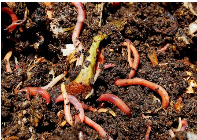
Worms converting kitchen scraps to compost.

Worm composting or vermicomposting, uses the digestive power of earthworms to consume and recycle kitchen waste and other organic matter to create a nutrient rich soil amendment called worm or vermi compost. Worm composting reduces the amount of garbage entering landfills and improves garden soils while providing a fun and rewarding hobby.