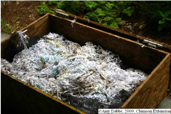
Worm bed with fresh damp paper bedding.

To set up a working worm composter, begin by filling the bin with an 8-inch layer of moist carbon-based material for the worms to bed in. Shredded strips of recycled, moistened newspaper, shredded office paper, composted manure, peat moss and coir fiber are all suitable bedding materials. Moisten the bedding before adding it to the bin and wring it out so that it feels a little wetter than a damp sponge. A 2-inch layer of new bedding should be added as the old bedding is consumed or whenever odors or fruit flies become a problem. Next, add a shovelful of garden soil to the bedding to add microorganisms and to provide grit for the worms to use as a digestive aid. Finally, pull aside the bedding in one corner of the bin and gently add the worms.