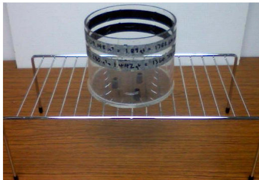
Figure 1. Test chamber used to determine the aeration porosity and water holding capacity of potting media.

A test chamber was designed and constructed to facilitate the measurement of the aeration porosity, water holding capacity, and total porosity using equations 2, 4, and 7 (Figure 1). The chamber was constructed from a section of Plexiglas pipe with an inside diameter of 14.6 cm (5.75 in) and a height of 8.25 cm (3.25 in). The bottom was a round, 0.635 cm (0.25 in) thick piece of Plexiglas sheet that was chemically welded to the pipe to form a water-tight seal. Three 0.813 cm (0.32 in) holes were drilled in the bottom of the chamber and were fitted with rubber stoppers that were flush with the inside surface of the bottom of the chamber when fully inserted. A circular piece of plastic window screen (1.27 mm or 0.05 in openings) was placed in the bottom of the test chamber to retain the media while water was allowed to drain from the pore volume. The chamber was placed on a level metal rack that facilitated the collection of water drained from saturated potting media.