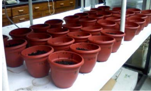
Figure 2. Experimental setup for the evaporation loss experiment.

The nominal 15 cm (6 in) diameter pots selected for use in this experiment were made from plastic to eliminate loss of water through the sides of the pots. They also had only one hole in the bottom to facilitate bringing the contents of each pot to saturation and then allowing pore water to drain. A total of nine pots were used for each of the four potting mixes to give a total of 36 pots for the study.