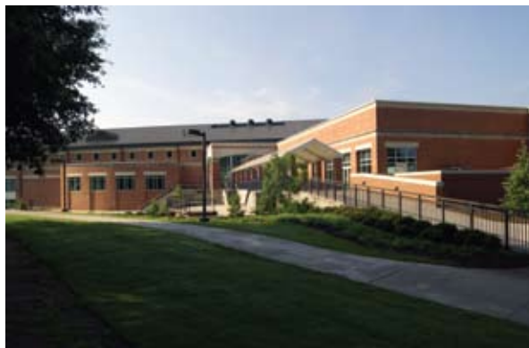
Hendrix Student Center