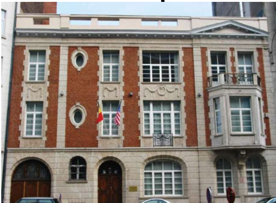
The Thomas Green Clemson University Brussels Center is a collaboration of Clemson, UCL and ICHEC.