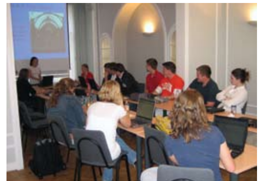
Student presentations in a CUBC classroom.