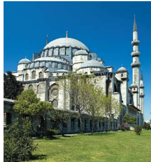
Turkey offers students a fascinating blend of Western and Eastern cultures.

Semester-long programs of study and exchange programs are thriving in Genoa, Italy; Barcelona, Spain; Cordoba, Argentina; Istanbul, Turkey; and Adelaide, Australia. Maymester and summer programs include Ghana; Turkey and Greece; Paris, France; St. Petersburg, Russia; Kyoto, Japan; Dalian, China; Xalapa, Mexico; and Siegen, Germany. We are currently expanding our programs in Barcelona and Istanbul and exploring future programs in India, China and South Africa.