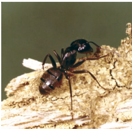
8. CARPENTER ANT