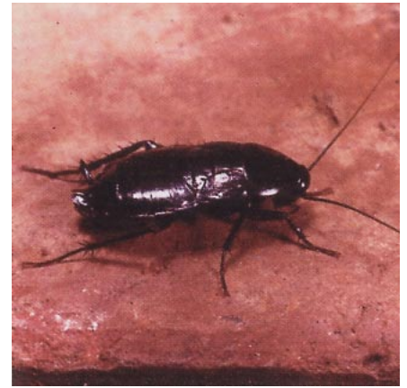
3. ORIENTAL COCKROACH