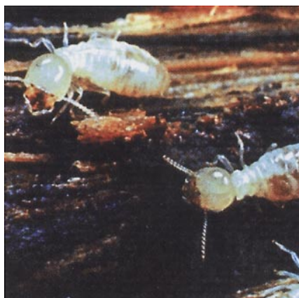
6. TERMITE WORKERS