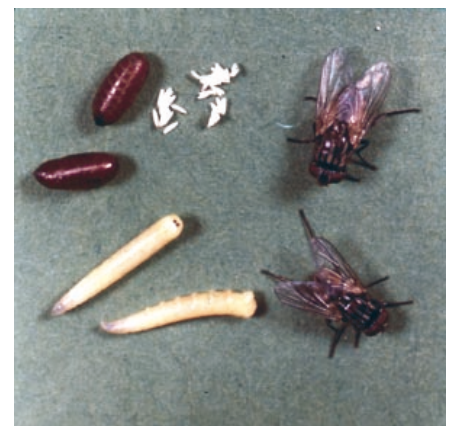
7. HOUSEFLY Adult-Right, Larvae-Bottom Left Pupae-Top Left, Eggs-Top Center