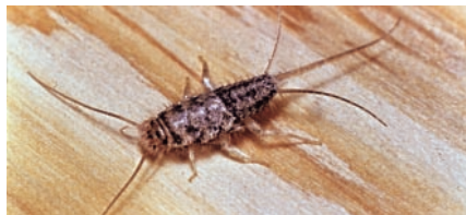
9. FIREBRAT-Upper 10. SILVERFISH-Lower