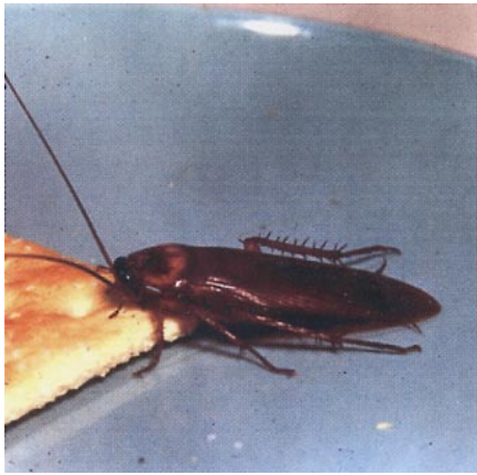
1. AMERICAN COCKROACH