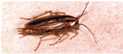
4. GERMAN COCKROACH-Upper 5. BROWN-BANDED COCKROACH- Lower