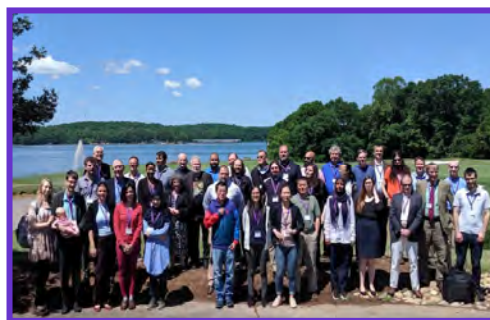
SELAC conferees gather at the Madren Center to discuss opportunities for astrophysics in the Southeast.

NIST-Gaithersburg, Los Alamos National Laboratory and the National Ignition Facility. Participants took time for a short outing into the South Carolina Botanical Gardens, and the meeting closed with a vibrant discussion of future plans for the community to bring additional laboratory astrophysics opportunities to the Southeast.