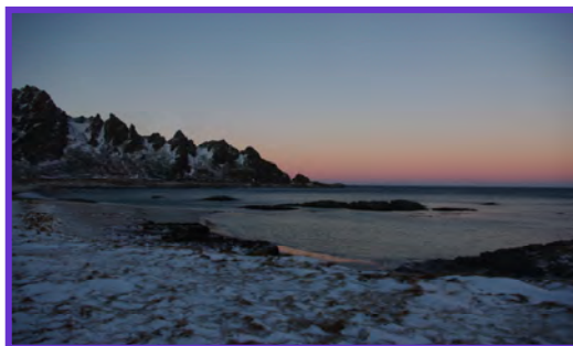
Norway is a principal site for the launching of sounding rockets to study atmospheric turbulence.