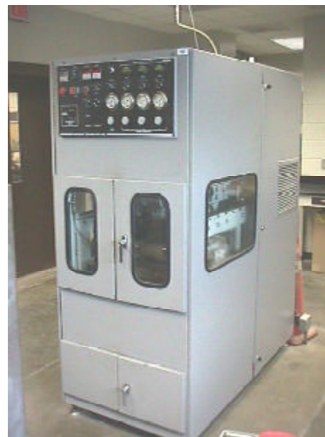
The Department recently purchased an Asphalt Pavement Analyzer (APA) for testing the rutting resistance of asphalt mixtures.

objective of this study is to use the APA with the GaDOT test procedure and specifications to evaluate the rutting characteristics of SCDOT high performance asphalt mix types (including Superpave) based on replicate testing and statistical analysis. To evaluate the rutting resistance of these mixtures, a fluctuating compaction level, dust-to-asphalt ratio, and polymer usage are being analyzed.