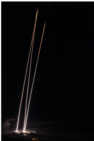
Super Soaker rocket launches show a portion of their trajectories.

This effect is often seen in nature when gases or liquids pass each other at different speeds, creating the curling pattern similar to waves on the beach or dust swirls in the desert. Now that Clemson scientists have observed the KHI in more detail than ever, they have a clearer understanding of how the winds in the upper atmosphere carry gases farther than they thought possible.