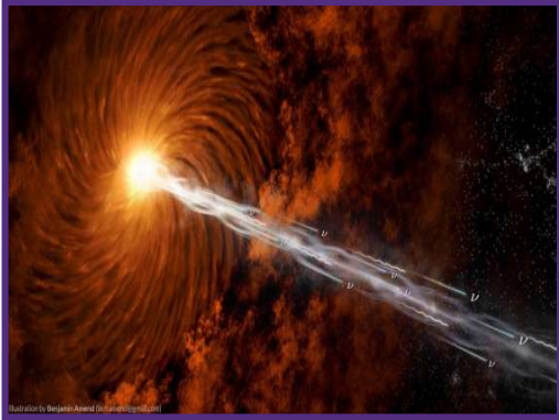
Illustration by graduate student Benjamin Amend

Cosmic rays, charged particles that travel up to nearly the speed of light from deep outer space, constantly bombard Earth.