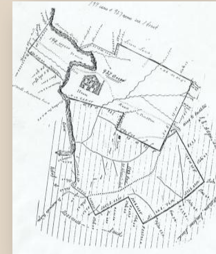
Plat of Hopewell Plantation and Cottage