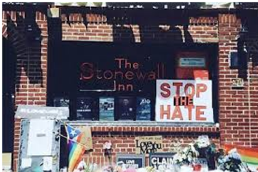
Illustration of Stonewall Inn, New York City, a pivotal place of the LGBTQ Civil Rights Movement

Office Hours: Zoom TR 9-10:30am & by appt.