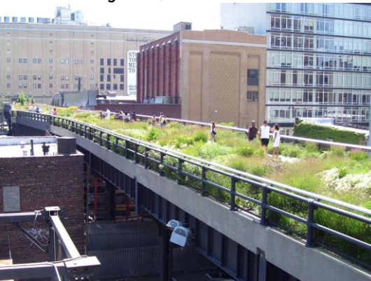
http://seas.umich.edu/research/faculty/joan_nassauer https://www.pps.org/article/rhester https://en.wikipedia.org/wiki/High_Line#/media/File:High_Line_20th_Street_looking_downtown.jpg