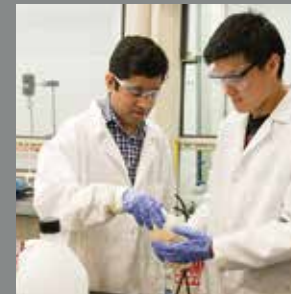
ULTRA-LIGHT AUTO DOORS