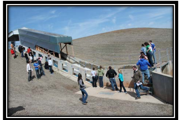
Touring OSU's Hydraulics Lab. Picture is of a stepped-spillway from a dammed lake