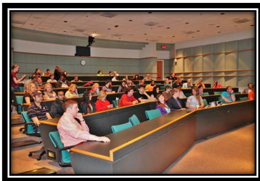
Listening to industry speakers