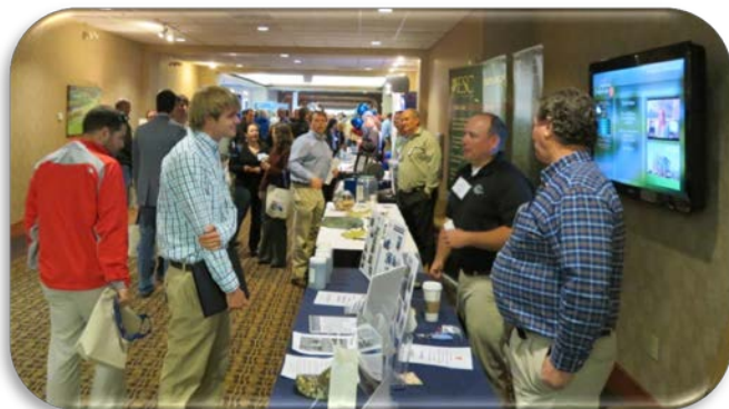
Vendors and attendees at the Madren Center on April 4 th .