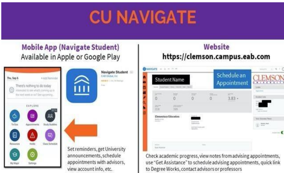
Figure 3. Student Orientation slide on how to access CU Navigate to schedule an appointment with Student Advising