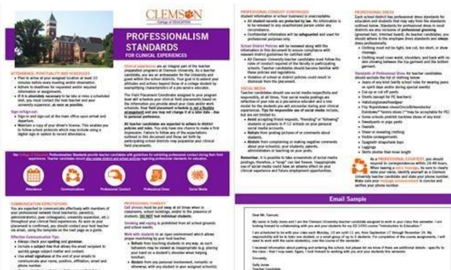
Figure 5. Facsimile of CoE Professionalism Standards

During the 2018-2019 school term, OFCPO faculty and staff, CoE faculty, and OFCO Advisory Board members collaborated on the creation of the Professionalism Standards for Clinical Experiences document to accompany the Code of Conduct established in the CoE conduct policy. Teacher candidates are responsible for accessing, reviewing, and maintaining familiarity with the document throughout their field experiences. Although a facsimile of the document is included in this section (see figure 5), teacher candidates should access the full-size version of the document to review: https://clemons.box.com/s/bhd048q5jrownmsnegjzs7dzav9d2cfo