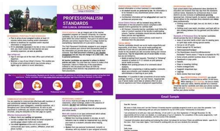
Figure 5. Facsimile of CoE Professionalism Standards

During the 2018-2019 school term, OFCPO faculty and staff, CoE faculty, and OFCO Advisory Board members collaborated on the creation of the Professionalism Standards for Clinical Experiences document to accompany the Code of Conduct established in the CoE conduct policy. Teacher candidates are responsible for accessing, reviewing, and maintaining familiarity with the document throughout their field experiences. Although a facsimile of the document is included in this section (see figure 5), teacher candidates should access the full-size version of the document to review: https://clemsun.box.com/s/bhd048q5jrownmsnegjzs7dzav9d2cfo