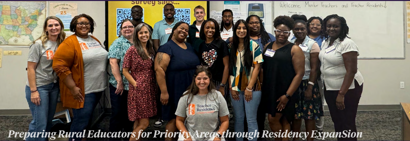
Preparing Rural Educators for Priority Areas through Residency Expansion