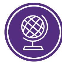
DIVERSITY, EQUITY & INCLUSION