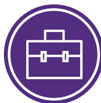
CAREER & PROFESSIONAL DEVELOPMENT