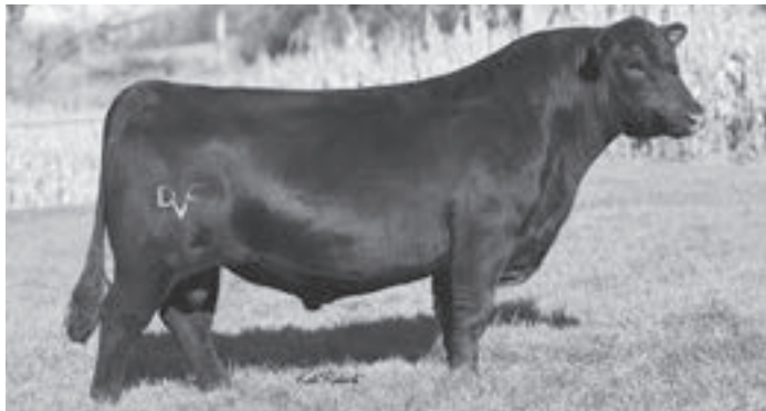
Deer Valley Old Hickory