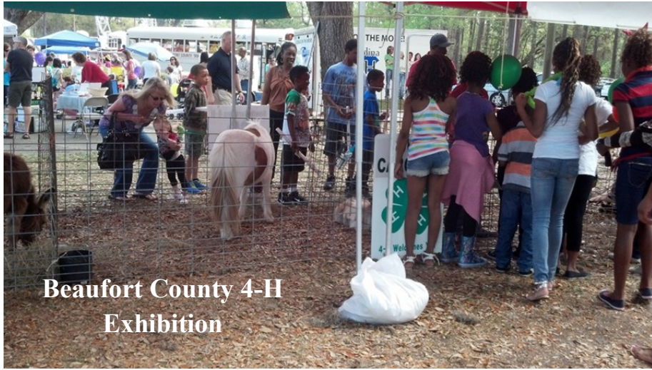
Beaufort County 4-H Exhibition