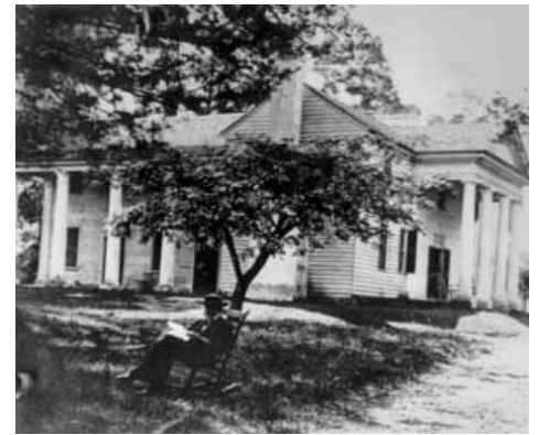
The first graduation was held in December 1896 with a graduating class of 37 students-- 15 in agricultural courses and 22 in engineering courses.

In 1914, the Cooperative Extension Service was established, fulfilling our land-grant mission.