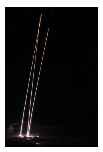
Super Soaker rocket launches show a portion of their trajectories.

This effect is often seen in nature when gases or liquids pass each other at different speeds, creating the curling pattern similar to waves on the beach or dust swirls in the desert. Now that Clemson scientists have observed the KHI in more detail than ever, they have a clearer understanding of how the winds in the upper atmosphere carry gases farther than they thought possible.