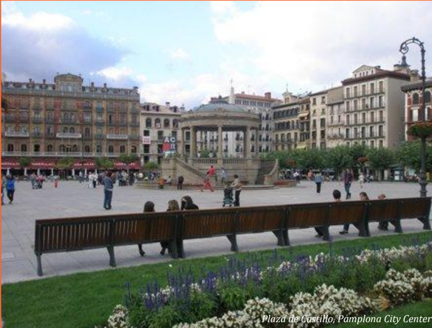
Plaza de Castillo, Pamplona City Center