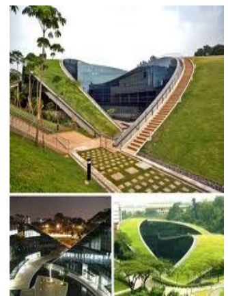
Nanyang Technological Institute