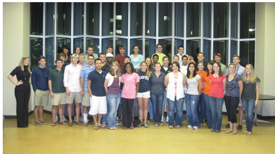
Club Picture - BioMEDS 2011

Received BS in Bioengineering from Clemson University. Current second year medical student who is finishing up his pre-clinical training this summer. At this point in his training, he is a student of basic medical/clinical sciences. Consequently, on a day to day basis he is mostly involved with studying class material and attending any labs or activities that the college of medicine has planned.