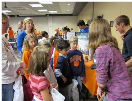
2nd Graders at the BioMEDS Display

heart valves, pacemakers, and synthetic arteries. The main attraction of our display was a heart rate and breathing monitor. We showed the children what their EKG looked like when in a resting state and then had them do jumping jacks and observe the difference in their heart rate and pulse. It was an incredible learning experience for our members because it forced us to simplify our day-to-day terminology down to a language that a child could understand.