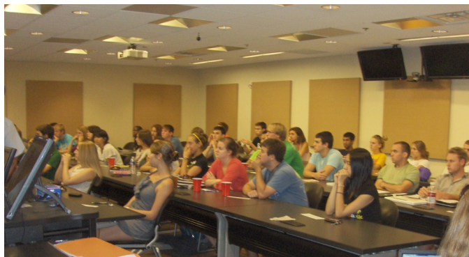
BioMEDS Club Meeting Spring 2011

kins University, the Medical University of South Carolina, Rice University, Worcester Polytechnic Institute, the University of Maryland, and Iowa State University. BioMEDS members will also be conducting research under national labs, such as the National Institute of Health and the National Aeronautics and Space Administration.