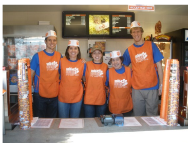
Working the Concessions, Go Tigers!

This semester BioMEDS had two major fundraisers. raising around $300 for the club. One of the fundraisers involved selling Candy Grams for Valentine's Day. Members of the department could purchase candy grams the week before Valentine's Day to send to students and faculty in the department. This was a great way for different groups in the department to interact with each other and support BioMEDS. This was the first year this fundraiser took place and many were unaware of it, however, in the future, it is predicted to be more profitable and a general morale booster for the department.