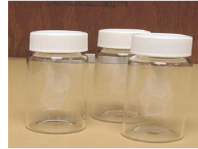
Vials for Insect Identification Samples