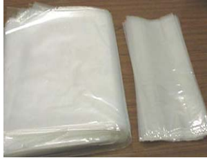
Plastic bags for Plant Problem and Plant Identification Samples