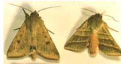
Bollworm (left) and tobacco budworm (right)

Captures of adult tobacco budworm (TBW) and bollworm (BW) in pheromone traps at EREC this season and last season are pictured below. The scales on the 2008 and 2007 charts are the same to illustrate where we are compared with last year. As you can see, we are observing increasing bollworm captures – on schedule with that observed during 2007.