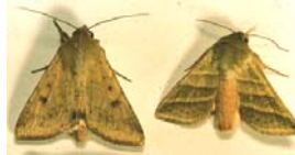
Bollworm (left) and tobacco budworm (right)

Captures of adult tobacco budworm (TBW) and bollworm (BW) in pheromone traps at EREC this season and last season are pictured below. The scales on the 2008 and 2007 charts are the same to illustrate where we are compared with last year. Once again, we observed tremendous captures of bollworm moths this past week. The pattern is looking more and more like that observed last year.