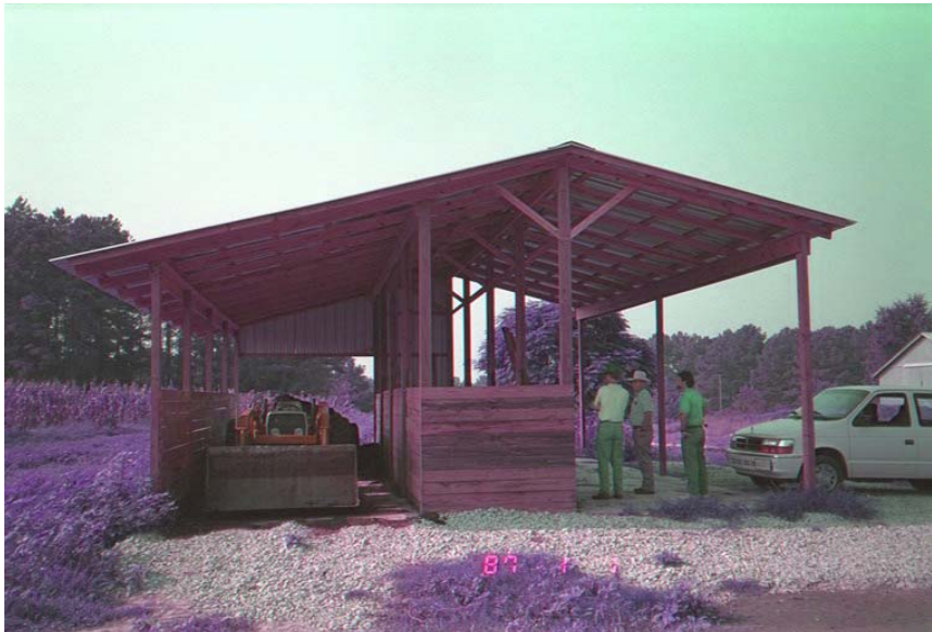
Figure 1. Poultry composting facility in Lexington County, South Carolina

Composting facilities shall be located as near the source of organic waste as practical. Composting operations shall be located where movement of any odors toward neighbors will be minimized. Setback distances should be in accordance to the South Carolina Department of Health and Environmental Control (SCDHEC) specifications. Typically for composting structures it will be equal to the setback(s) for the facility.