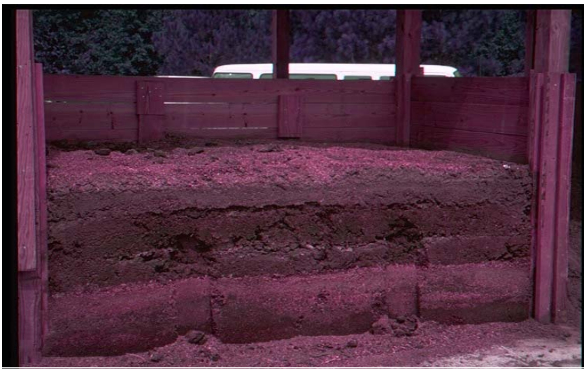
Figure 4. Composting bin for a 650 pound boar in Dorchester County, SC. The picture shows the layering of sawdust, broiler litter, and carcass.