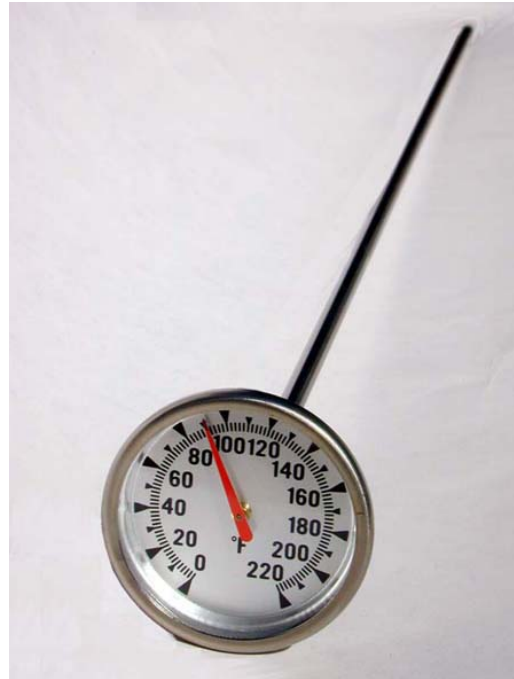
Figure 5. Typical thermometer for monitoring compost.

A good carcass compost should heat up to the 110 – 150°F range within a few days. Failure of the compost material to heat up properly normally results from two causes. First, the nitrogen source is inadequate (example - wet or leached litter). A pound of commercial fertilizer spread over a carcass layer will usually solve this problem. Secondly, composting fails when too much water has been added and the compost pile becomes anaerobic. An anaerobic compost bin is characterized by temperatures less than 120°F, offensive odors, and black, oozing compound flowing from the bottom of the compost bin.