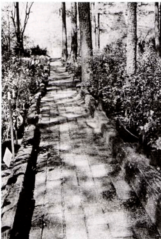
Nurseries Caroliniana retail garden center has paved walks and mature plant material on display

Gerald's congenial personality and plant problem diagnostic skills assure continued success for this retail nursery. Tour groups visiting the wholesale nursery regularly visit the retail garden center to purchase collectible plants. The future holds additional challenges for the retail center as highway expansion threatens to claim 2/3 of the existing parking area.