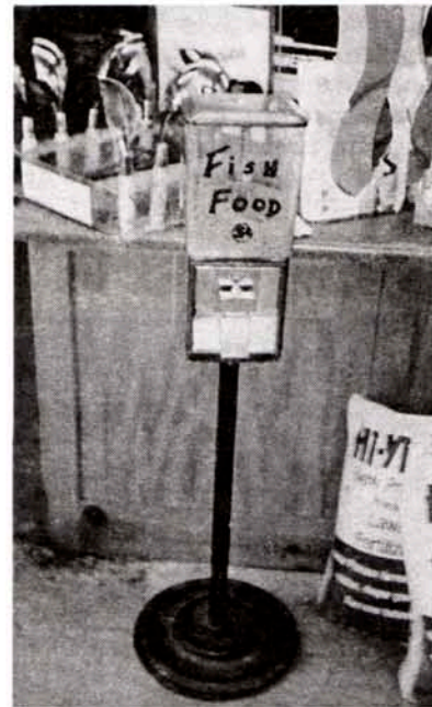
Feeding the fish is a customer attraction at Nurseries Caroliniana garden center