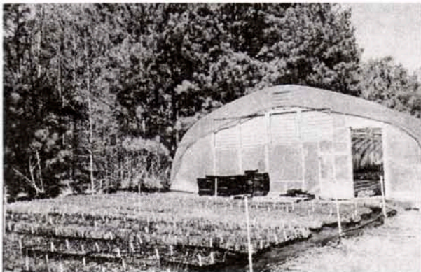
Wholesale propagation at Nurseries Caroliniana