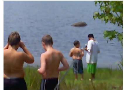
Turtle Watching at 4-H2O Camp 2008

Keep Fairfield Beautiful is partnering with Clemson Extension to offer our 3rd Annual 4-H2O Environmental Camp this year. We will kick off our Canoes for Conservation at that event. The Monday-Friday event is conducted at the Town of Winnsboro Reservoir. Within the environmental camp our students learn stewardship as well as the scientific reasons why we need to protect our planet. We explore water testing, water and waste treatment, watersheds, tree identifying. We learn about the natural habitat, boating, fishing, as well as local residents come and explain how their jobs are tied to the water sources in our county. There is also swimming and crafts. Each year within our 4-H2O Camp, we do a reservoir clean up. Students learn first hand of the consequences of pollution. This program is a positive learning tool to actively engage children, their parents and all citizens of Fairfield County to rediscover the beautiful wonders of nature. The 4-H2O camp is open to Fairfield County children ages 9-13. Campers are required to be able to swim. There is a $35 activity fee for the 5 day camp. Hours of camp operation are 9 am - 4 pm. For more information, call the Fairfield County Extension office at 803-635-4722.