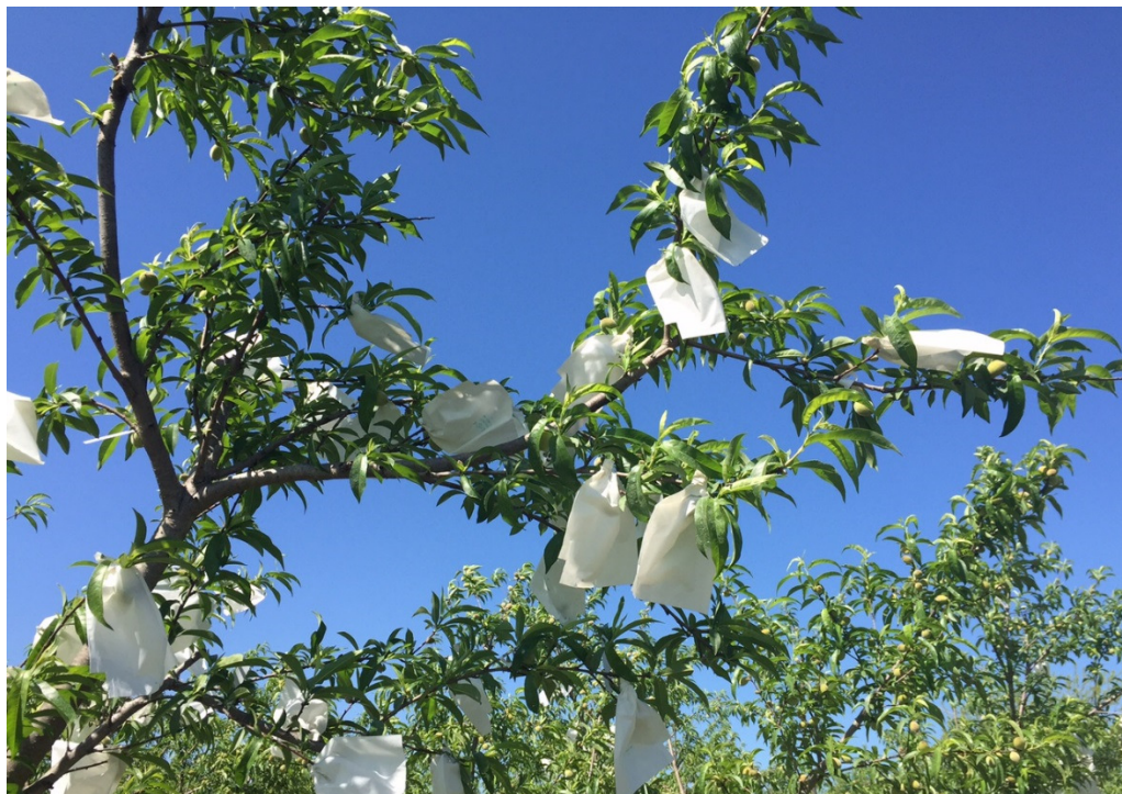
BAGGED PEACHES IN SOUTH CAROLINA