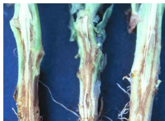
Systemic blue mold, vascular necrosis