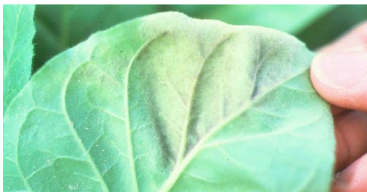
Blue mold ( Peronospora tabacina sporulation on undersurface of leaf)