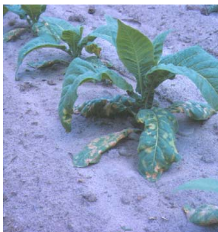
Leaf lesions on field tobacco