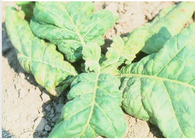
Plant stunting caused by early systemic infection