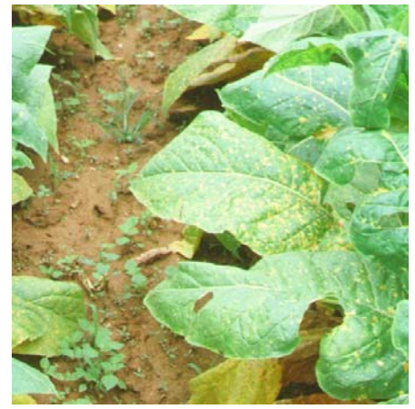
Foliar symptoms of Blue Mold