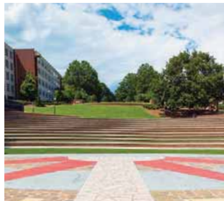
Carillon Garden With the Outdoor Amphitheater, reflection pond and Cooper Library all in view, you'll be hard-pressed to find a more picturesque spot on campus.