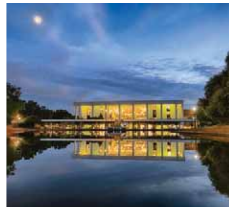
Reflection Pond Located just outside of Cooper Library, the reflection pond provides a scenic backdrop during any season.