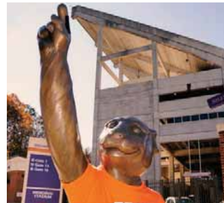
Tiger Mascot Statue Show your Solid Orange pride by posing next to the Tiger statue located outside Gate 1 of Memorial Stadium.