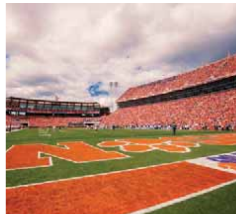
Memorial Stadium Memorial Stadium, also known as Death Valley, is home to the three-time National Football Champions and located right on campus.