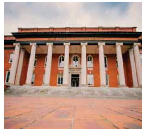
Steps of Sikes The steps of Sikes Hall are a popular spot among students for senior portraits, graduation pictures and other group photos.