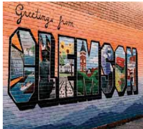
Clemson Mural (Downtown) Located on the wall outside of Tiger Sports Shop (364 College Ave.), this mural design is inspired by the look of a vintage postcard and captures the close-knit town-gown relationship.

Get your picture next to these Clemson landmarks.