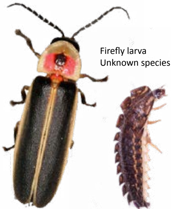
Firefly larva Unknown species

Make a sketch of the fireflies you find - can you identify the species? Males have larger lanterns (2 body segments rather than part of one or two segments).