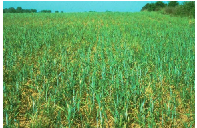
Symptoms of Hessian fly damage can include weak stands, dead tillers, stunted, erratic head height, and lodging.

peeling all the leaf sheaths away from the stem, all the way down to their point of attachment. This is below the soil line on tillers that have not yet jointed. The white maggots or brown seed-like puparia are always located at the feeding site above the attachment point of the leaf sheath to the stem. On lodged stems look for the insect just above the node where the stem broke. If maggots or puparia can not be found, Hessian fly is not the cause of the problem. Even after the adult emerges, the tell-tale brown pupal case remains behind in a depression on the stem.