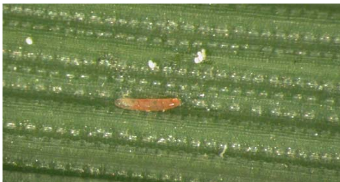
Hessian fly egg. Laid on upper leaf surface of new leaves. Eggs look like pink sausages laid end-to-end in grooves of wheat leaves. 10X hand lens needed to see eggs in field.

The life cycle is shown in Fig. 1. The adult (fly) stage will very seldom be noticed even where damage is severe. It is a black gnat about 1/8 inch long. The female is filled with eggs, which give the body a red color. Many harmless or beneficial insects are often confused with Hessian fly adults and it is probably best to not be concerned with identification of the adult stage. Adults live only 2 to 3 days, long enough to mate and lay eggs.