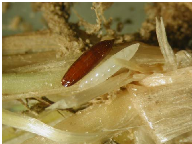
White larvae and brown pupal cases are found by peeling wheat leaves away from stem on dead, weak, or lodged tillers. Always found below the soil line until jointing.

but when abundant can barely be seen with the unaided eye if the leaf is held at an angle to bright sunlight. Under 10X magnification eggs can clearly be seen lying in parallel grooves of the upper leaf surface. When abundant, they resemble a string of pink sausages laid end to end.